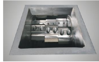
Crushing Chamber/ Kırma Haznesi