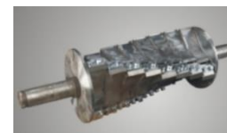
Flake cutter saddle/ Kademeli bıçak