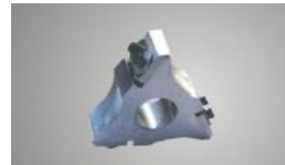
Cutter saddle/ Bıçak