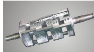
GD flat cutter saddle/ GD düz bıçak