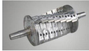
GY claw cutter saddle/ GY pençe bıçak